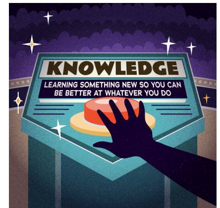
This Month's Virtue